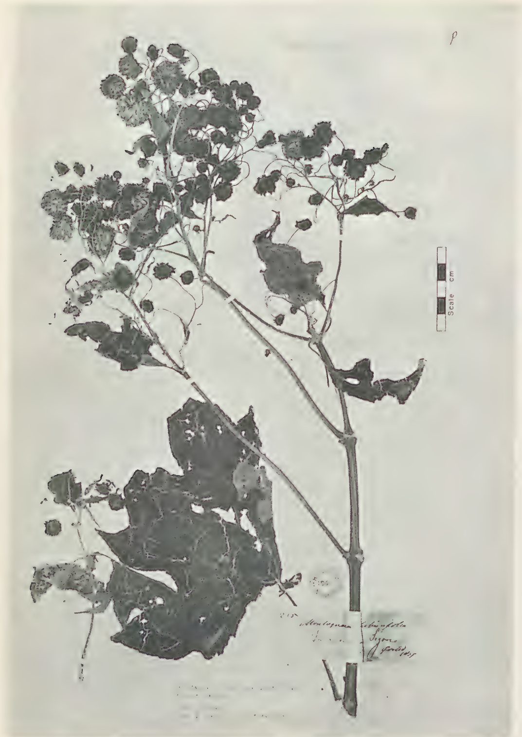
Fig. 6. Lectotype of the name Montanoa hibiscifolia (Benth.) Sch. Bip. ex C. Koch; Herb. K.